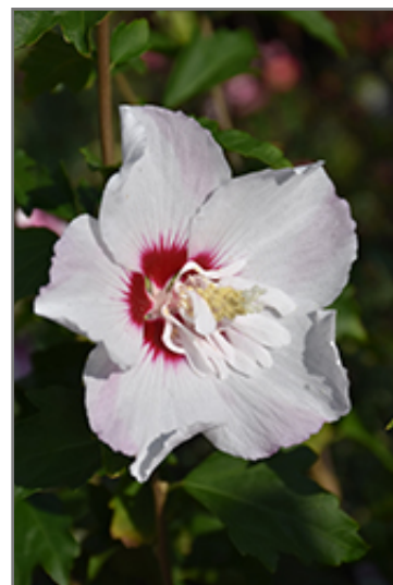
Fiji Rose of Sharon flowers

Outstanding semi-double blooms are soft pink with a deep red center; a tall, stiffly upright shrub with vase shape habit; extremely showy flowers throughout summer; very adaptable plant, but prefers full sun; can be trained into a small tree