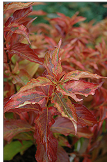
My Monet Sunset Weigela in fall

My Monet Sunset Weigela makes a fine choice for the outdoor landscape, but it is also well-suited for use in outdoor pots and containers. It is often used as a 'filler' in the 'spiller-thriller-filler' container combination, providing a mass of flowers and foliage against which the thriller plants stand out. Note that when grown in a container, it may not perform exactly as indicated on the tag - this is to be expected. Also note that when growing plants in outdoor containers and baskets, they may require more frequent waterings than they would in the yard or garden. Be aware that in our climate, most plants cannot be expected to survive the winter if left in containers outdoors, and this plant is no exception. Contact our experts for more information on how to protect it over the winter months.