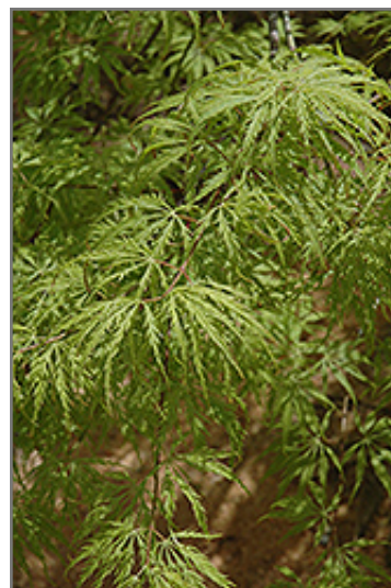
Filigree Green Lace Japanese Maple foliage