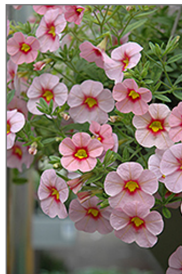
Aloha Tiki Soft Pink Calibrachoa flowers