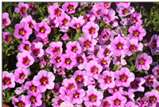
Aloha Tiki Soft Pink Calibrachoa flowers

Aloha Tiki Soft Pink Calibrachoa is recommended for the following landscape applications;