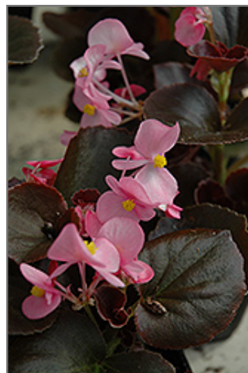
Cocktail Gin Begonia flowers

Cocktail Gin Begonia is recommended for the following landscape applications;