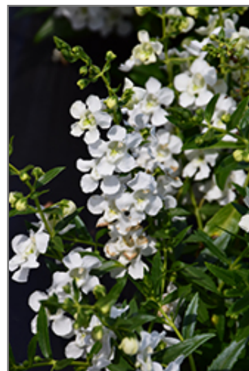
AngelMist Spreading White Angelonia flowers

This plant will require occasional maintenance and upkeep, and should not require much pruning, except when necessary, such as to remove dieback. It is a good choice for attracting butterflies to your yard, but is not particularly attractive to deer who tend to leave it alone in favor of tastier treats. It has no significant negative characteristics.