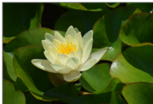
Marliacea Chromatella Hardy Water Lily flowers