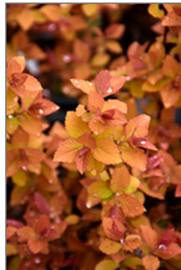
Double Play Big Bang Spirea foliage

This shrub should only be grown in full sunlight. It prefers to grow in average to moist conditions, and shouldn't be allowed to dry out. It is not particular as to soil type or pH. It is highly tolerant of urban pollution and will even thrive in inner city environments. This particular variety is an interspecific hybrid.