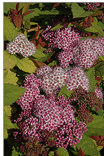
Double Play Big Bang Spirea flowers

Double Play Big Bang Spirea is recommended for the following landscape applications;