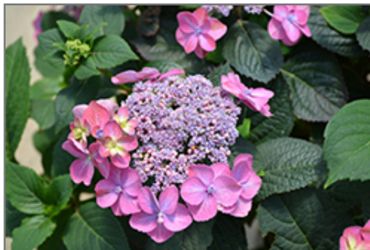
Tuff Stuff Hydrangea flowers

This shrub performs well in both full sun and full shade. However, you may want to keep it away from hot, dry locations that receive direct afternoon sun or which get reflected sunlight, such as against the south side of a white wall. It prefers to grow in average to moist conditions, and shouldn't be allowed to dry out. It is not particular as to soil type, but has a definite preference for acidic soils. It is somewhat tolerant of urban pollution, and will benefit from being planted in a relatively sheltered location. Consider applying a thick mulch around the root zone in winter to protect it in exposed locations or colder microclimates. This is a selected variety of a species not originally from North America.