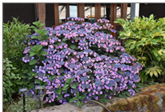
Tuff Stuff Hydrangea in bloom