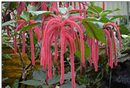
Firetail Chenille Plant flowers