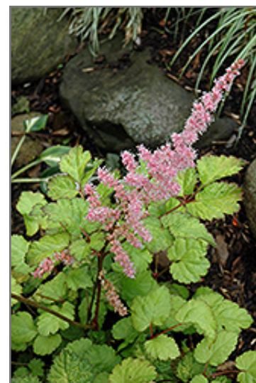
Amber Moon Chinese Astilbe flowers