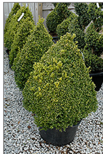
Green Mountain Boxwood (pyramid form)

Green Mountain Boxwood (pyramid form) will grow to be about 3 feet tall at maturity, with a spread of 3 feet. It tends to fill out right to the ground and therefore doesn't necessarily require facer plants in front. It grows at a slow rate, and under ideal conditions can be expected to live for approximately 30 years.