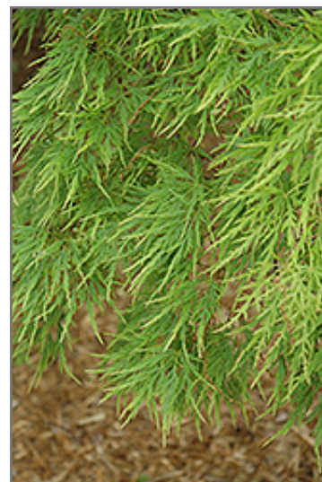
Cutleaf Japanese Maple foliage

Cutleaf Japanese Maple is recommended for the following landscape applications;