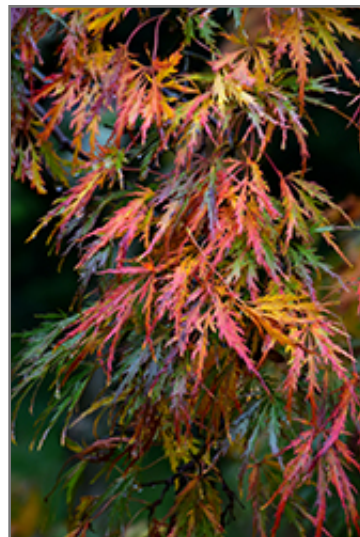
Cutleaf Japanese Maple in fall

Cutleaf Japanese Maple makes a fine choice for the outdoor landscape, but it is also well-suited for use in outdoor pots and containers. Because of its height, it is often used as a 'thriller' in the 'spiller-thriller-filler' container combination; plant it near the center of the pot, surrounded by smaller plants and those that spill over the edges. It is even sizeable enough that it can be grown alone in a suitable container. Note that when grown in a container, it may not perform exactly as indicated on the tag - this is to be expected. Also note that when growing plants in outdoor containers and baskets, they may require more frequent waterings than they would in the yard or garden. Be aware that in our climate, most plants cannot be expected to survive the winter if left in containers outdoors, and this plant is no exception. Contact our experts for more information on how to protect it over the winter months.