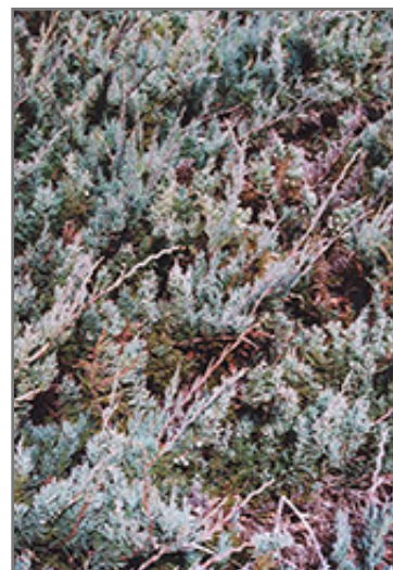
Alpine Creeping Juniper

Alpine Creeping Juniper will grow to be about 24 inches tall at maturity, with a spread of 5 feet. It tends to fill out right to the ground and therefore doesn't necessarily require facer plants in front. It grows at a slow rate, and under ideal conditions can be expected to live for approximately 30 years.