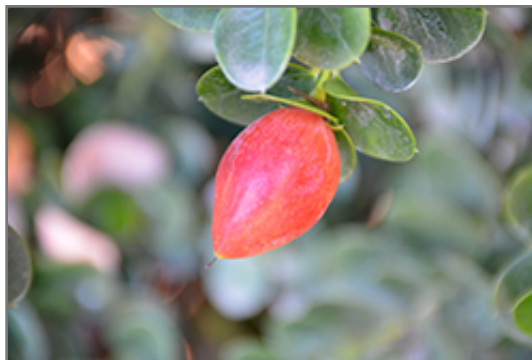
Natal Plum fruit

Natal Plum is a good choice for the edible garden, but it is also well-suited for use in outdoor pots and containers. Its large size and upright habit of growth lend it for use as a solitary accent, or in a composition surrounded by smaller plants around the base and those that spill over the edges. It is even sizeable enough that it can be grown alone in a suitable container. Note that when grown in a container, it may not perform exactly as indicated on the tag - this is to be expected. Also note that when growing plants in outdoor containers and baskets, they may require more frequent waterings than they would in the yard or garden. Be aware that in our climate, most plants cannot be expected to survive the winter if left in containers outdoors, and this plant is no exception. Contact our experts for more information on how to protect it over the winter months.