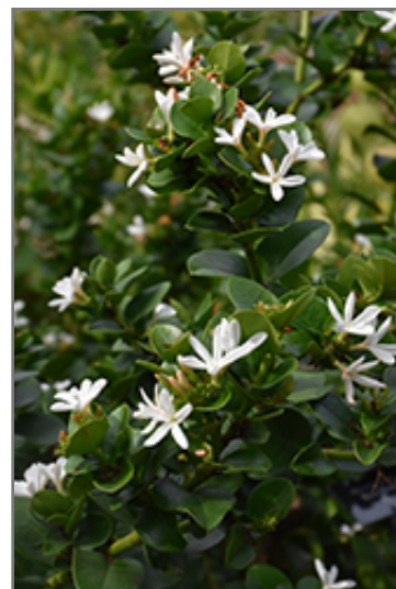
Natal Plum flowers

Natal Plum has attractive dark green evergreen foliage which emerges coppery-bronze in spring on a plant with an upright spreading habit of growth. The glossy round leaves are highly ornamental and remain dark green throughout the winter. It features dainty lightly-scented white star-shaped flowers along the branches from early spring to mid summer. It features an abundance of magnificent red berries from late spring to late fall.