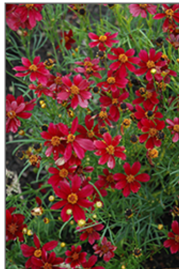
Red Satin Tickseed flowers