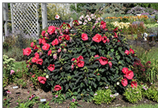
Mars Madness Hibiscus in bloom