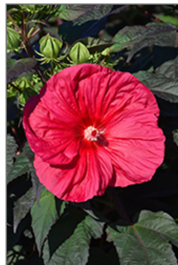
Mars Madness Hibiscus flowers

This plant will require occasional maintenance and upkeep, and should be cut back in late fall in preparation for winter. It is a good choice for attracting butterflies and hummingbirds to your yard, but is not particularly attractive to deer who tend to leave it alone in favor of tastier treats. Gardeners should be aware of the following characteristic(s) that may warrant special consideration;