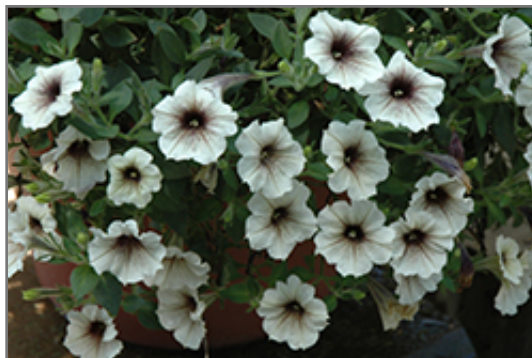
Supertunia Latte Petunia flowers