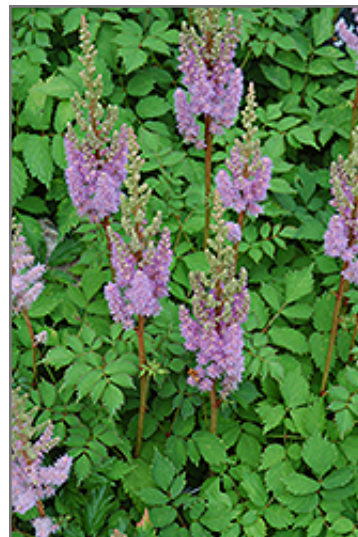
Dwarf Chinese Astilbe flowers

Dwarf Chinese Astilbe is recommended for the following landscape applications;