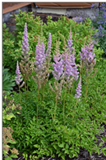
Dwarf Chinese Astilbe in bloom