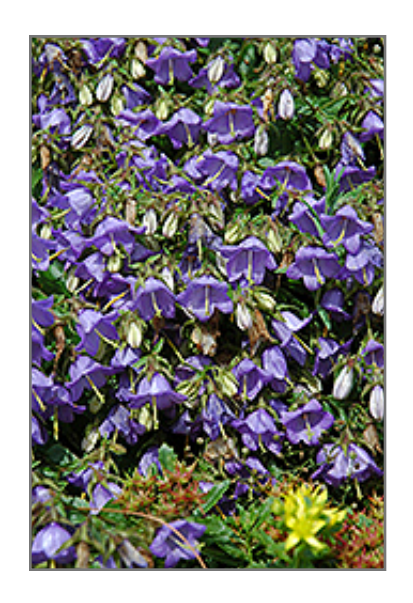
Bellflower flowers

885 Stewart Blvd. Brockville, Ontario (613) 803-9000