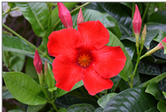
Red Mandevilla flowers

There are many factors that will affect the ultimate height, spread and overall performance of a plant when grown indoors; among them, the size of the pot it's growing in, the amount of light it receives, watering frequency, the pruning regimen and repotting schedule. Use the information described here as a guideline only; individual performance can and will vary. Please contact the store to speak with one of our experts if you are interested in further details concerning recommendations on pot size, watering, pruning, repotting, etc.