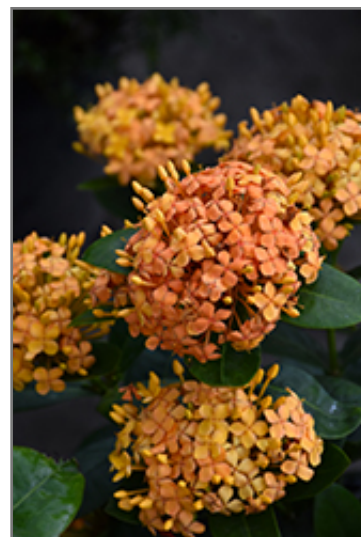
Maui Ixora flowers

There are many factors that will affect the ultimate height, spread and overall performance of a plant when grown indoors; among them, the size of the pot it's growing in, the amount of light it receives, watering frequency, the pruning regimen and repotting schedule. Use the information described here as a guideline only; individual performance can and will vary. Please contact the store to speak with one of our experts if you are interested in further details concerning recommendations on pot size, watering, pruning, repotting, etc.