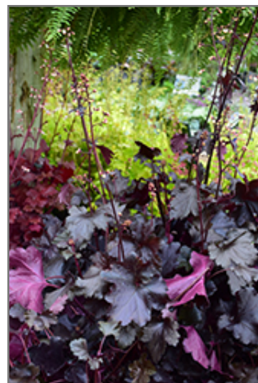
Black Pearl Coral Bells in bloom

Black Pearl Coral Bells is recommended for the following landscape applications;