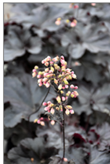
Black Pearl Coral Bells flowers