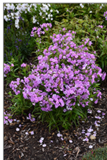
Fashionably Early Princess Garden Phlox in bloom