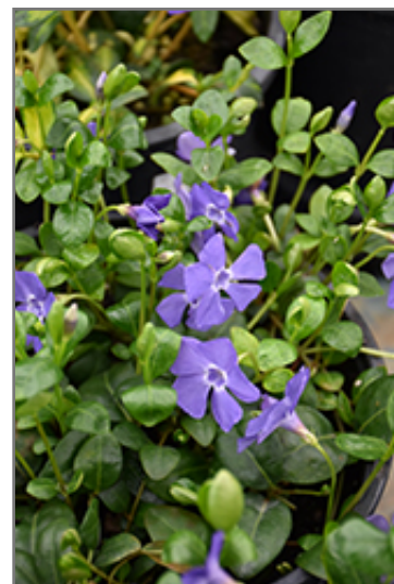
Bowles Cunningham Periwinkle flowers