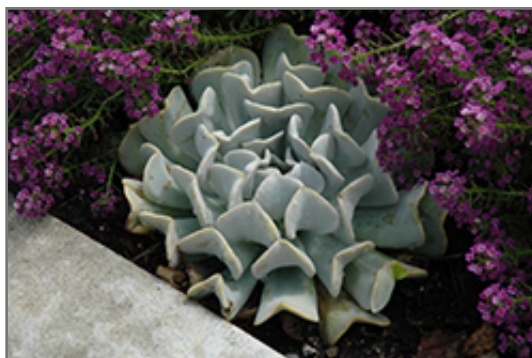
Topsy Turvy Echeveria