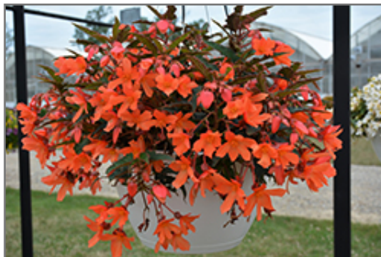
Beauvilia Salmon Begonia in bloom

Beauvilia Salmon Begonia is a fine choice for the garden, but it is also a good selection for planting in outdoor containers and hanging baskets. Because of its trailing habit of growth, it is ideally suited for use as a 'spiller' in the 'spiller-thriller-filler' container combination; plant it near the edges where it can spill gracefully over the pot. Note that when growing plants in outdoor containers and baskets, they may require more frequent waterings than they would in the yard or garden.