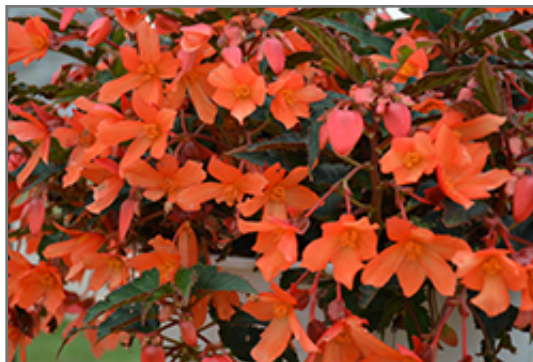
Beauvilia Salmon Begonia flowers