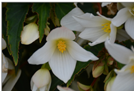
Beauvilia White Begonia flowers