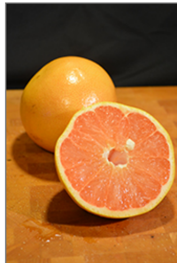
Ruby Red Grapefruit fruit and flesh

Aside from its primary use as an edible, Ruby Red Grapefruit is suitable for the following landscape applications;