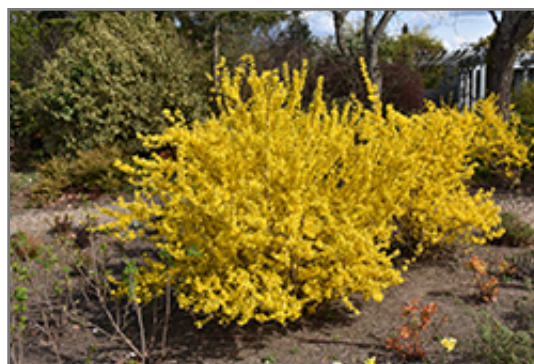
Magical Gold Forsythia in bloom