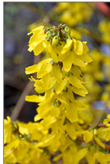
Magical Gold Forsythia flowers

Magical Gold Forsythia makes a fine choice for the outdoor landscape, but it is also well-suited for use in outdoor pots and containers. Because of its height, it is often used as a 'thriller' in the 'spiller-thriller-filler' container combination; plant it near the center of the pot, surrounded by smaller plants and those that spill over the edges. It is even sizeable enough that it can be grown alone in a suitable container. Note that when grown in a container, it may not perform exactly as indicated on the tag - this is to be expected. Also note that when growing plants in outdoor containers and baskets, they may require more frequent waterings than they would in the yard or garden. Be aware that in our climate, most plants cannot be expected to survive the winter if left in containers outdoors, and this plant is no exception. Contact our experts for more information on how to protect it over the winter months.