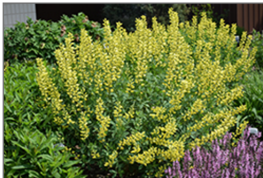
American Goldfinch False Indigo in bloom

American Goldfinch False Indigo will grow to be about 3 feet tall at maturity, with a spread of 5 feet. It tends to be leggy, with a typical clearance of 1 foot from the ground, and should be underplanted with lower-growing perennials. It grows at a slow rate, and under ideal conditions can be expected to live for approximately 25 years. As an herbaceous perennial, this plant will usually die back to the crown each winter, and will regrow from the base each spring. Be careful not to disturb the crown in late winter when it may not be readily seen!