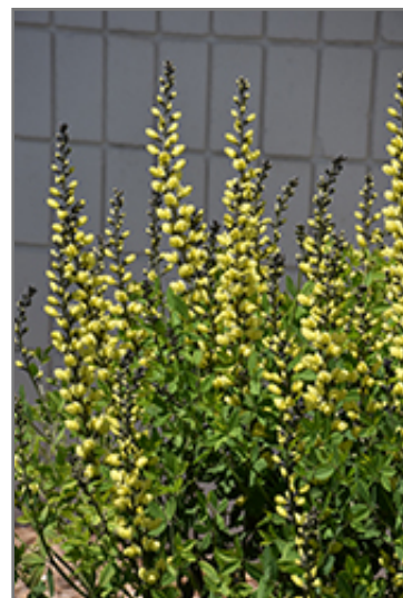
American Goldfinch False Indigo flowers

American Goldfinch False Indigo is recommended for the following landscape applications;