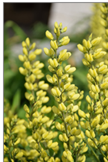
American Goldfinch False Indigo flowers