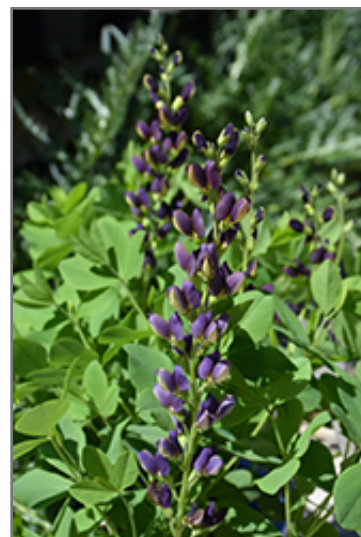
Indigo Spires False Indigo flowers

Indigo Spires False Indigo is recommended for the following landscape applications;