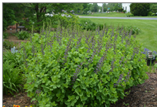
Indigo Spires False Indigo in bloom