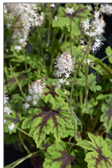
Fingerpaint Foamflower flowers