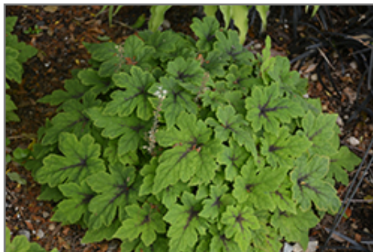
Fingerpaint Foamflower

Fingerpaint Foamflower is recommended for the following landscape applications;