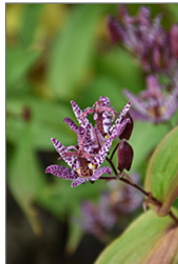
Toad Lily flowers