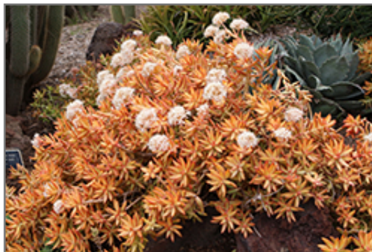
Firestorm Stonecrop in bloom

Firestorm Stonecrop is recommended for the following landscape applications;