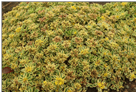
Rock 'N Low Boogie Woogie Stonecrop flowers

Rock 'N Low Boogie Woogie Stonecrop is a dense herbaceous perennial with a mounded form. Its medium texture blends into the garden, but can always be balanced by a couple of finer or coarser plants for an effective composition.