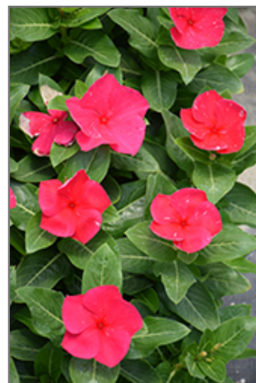
Cora XDR Punch flowers