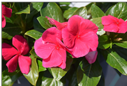
Cora XDR Punch flowers

Cora XDR Punch is recommended for the following landscape applications;