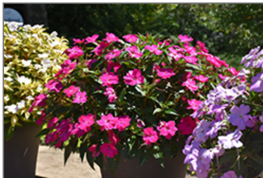
SunPatiens Vigorous Rose Pink New Guinea Impatiens in bloom

SunPatiens Vigorous Rose Pink New Guinea Impatiens will grow to be about 3 feet tall at maturity, with a spread of 3 feet. When grown in masses or used as a bedding plant, individual plants should be spaced approximately 32 inches apart. Its foliage tends to remain dense right to the ground, not requiring facer plants in front. This fast-growing annual will normally live for one full growing season, needing replacement the following year.