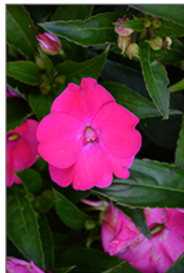
SunPatiens Vigorous Rose Pink New Guinea Impatiens flowers

SunPatiens Vigorous Rose Pink New Guinea Impatiens is recommended for the following landscape applications;