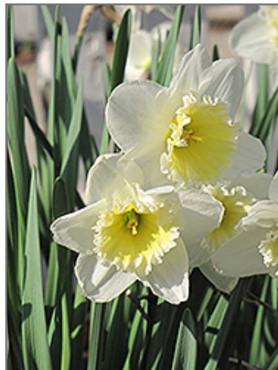
Ice Follies Daffodil flowers

Ice Follies Daffodil will grow to be about 12 inches tall at maturity extending to 18 inches tall with the flowers, with a spread of 8 inches. When grown in masses or used as a bedding plant, individual plants should be spaced approximately 4 inches apart. It grows at a medium rate, and under ideal conditions can be expected to live for approximately 10 years. As an herbaceous perennial, this plant will usually die back to the crown each winter, and will regrow from the base each spring. Be careful not to disturb the crown in late winter when it may not be readily seen! As this plant tends to go dormant in summer, it is best interplanted with late-season bloomers to hide the dying foliage.