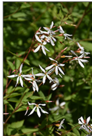
Bowman's Root flowers

Bowman's Root is recommended for the following landscape applications;