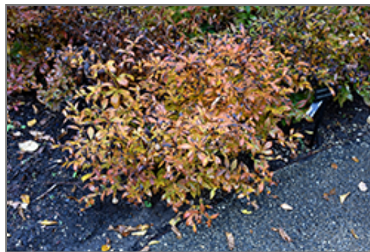
Bowman's Root in fall