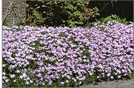
Emerald Blue Moss Phlox in bloom

This plant does best in full sun to partial shade. It prefers dry to average moisture levels with very well-drained soil, and will often die in standing water. It is considered to be drought-tolerant, and thus makes an ideal choice for a low-water garden or xeriscape application. It is not particular as to soil type, but has a definite preference for alkaline soils. It is highly tolerant of urban pollution and will even thrive in inner city environments. Consider covering it with a thick layer of mulch in winter to protect it in exposed locations or colder microclimates. This is a selection of a native North American species. It can be propagated by division; however, as a cultivated variety, be aware that it may be subject to certain restrictions or prohibitions on propagation.