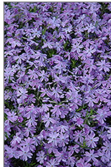
Emerald Blue Moss Phlox flowers