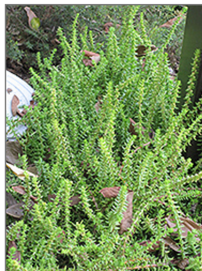
Watch Chain Crassula