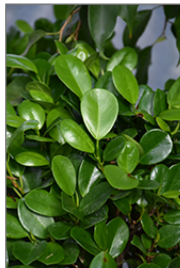
Moclame Ficus foliage

-- THIS IS A HOUSEPLANT AND IS NOT MEANT TO SURVIVE THE WINTER OUTDOORS IN OUR CLIMATE --