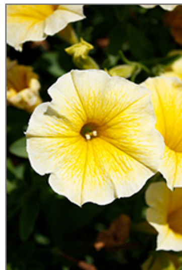
Bee's Knees Petunia flowers

Bee's Knees Petunia is recommended for the following landscape applications;