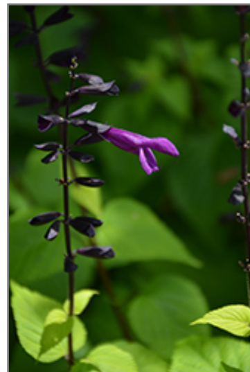
Bodacious Smokey Jazz Sage flowers

Bodacious Smokey Jazz Sage is a fine choice for the garden, but it is also a good selection for planting in outdoor pots and containers. With its upright habit of growth, it is best suited for use as a 'thriller' in the 'spiller-thriller-filler' container combination; plant it near the center of the pot, surrounded by smaller plants and those that spill over the edges. It is even sizeable enough that it can be grown alone in a suitable container. Note that when growing plants in outdoor containers and baskets, they may require more frequent waterings than they would in the yard or garden. Be aware that in our climate, most plants cannot be expected to survive the winter if left in containers outdoors, and this plant is no exception. Contact our experts for more information on how to protect it over the winter months.