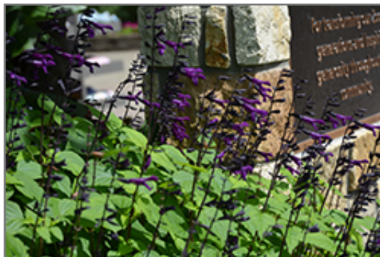
Bodacious Smokey Jazz Sage flowers

Bodacious Smokey Jazz Sage is an herbaceous perennial with an upright spreading habit of growth. Its medium texture blends into the garden, but can always be balanced by a couple of finer or coarser plants for an effective composition.