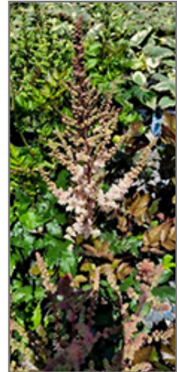
Pink Lightning Astilbe flowers