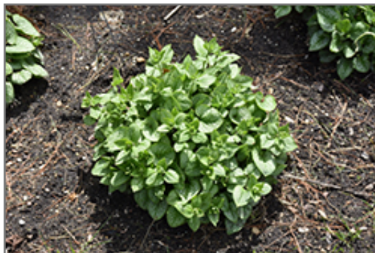
Jack of Diamonds Bugloss

Jack of Diamonds Bugloss will grow to be about 14 inches tall at maturity, with a spread of 30 inches. When grown in masses or used as a bedding plant, individual plants should be spaced approximately 28 inches apart. It grows at a medium rate, and under ideal conditions can be expected to live for approximately 10 years. As an herbaceous perennial, this plant will usually die back to the crown each winter, and will regrow from the base each spring. Be careful not to disturb the crown in late winter when it may not be readily seen!