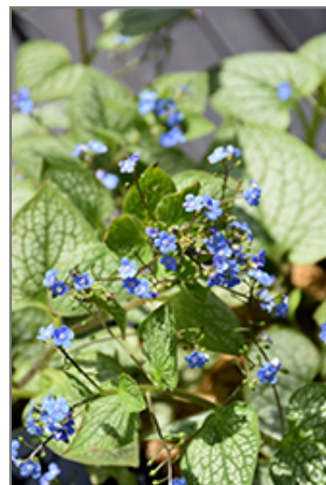
Jack of Diamonds Bugloss flowers

Jack of Diamonds Bugloss is recommended for the following landscape applications;