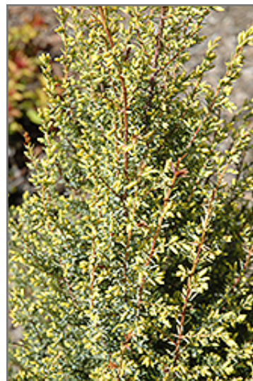
Gold Cone Juniper foliage