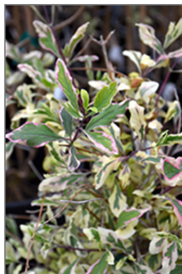
Harlequin Honeysuckle foliage