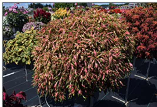
PartyTime Reggae Salmon Coleus